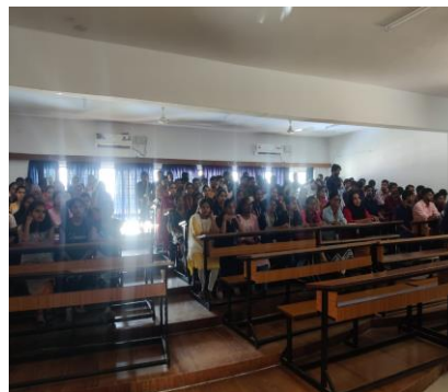
Dept.of E&C,EEE, Students attended the session in eee seminar hall