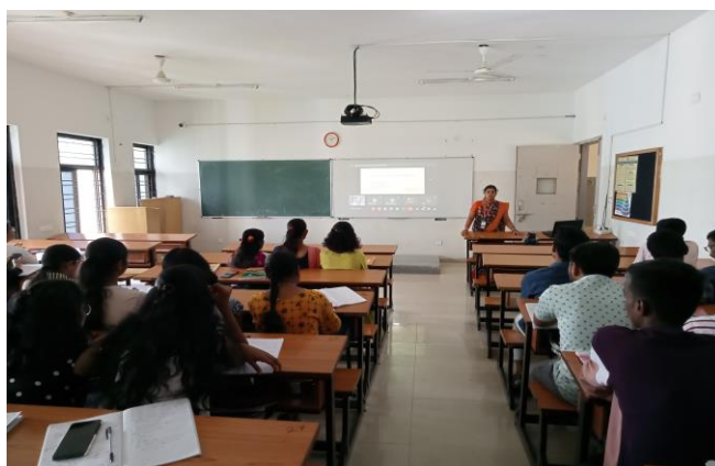
Dept.of CS&E, students attended the Session in cse classroom .