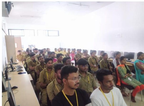
Dept.of Civil students attended the session CAD lab.