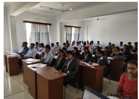
Dept.Of MBA Students attended session.