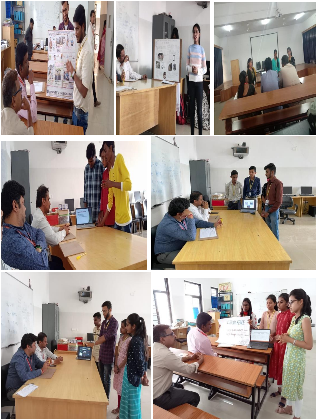
Various departments students presentating there business plan