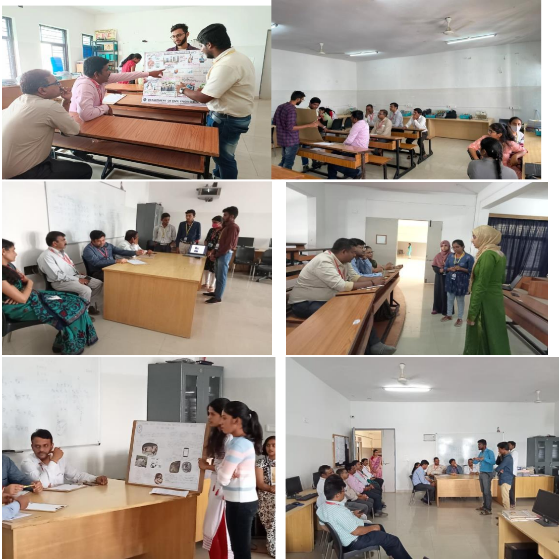
Queries by judges