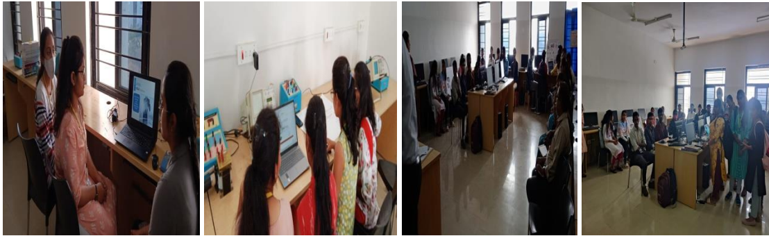
Participants are gathered in EEE Dept. lab for presentation