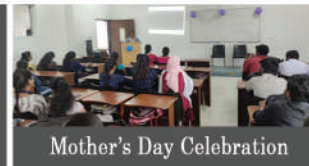
Mother's Day Celebration