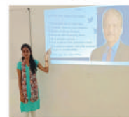
Essence of Leadership