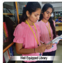
Well Equipped Library