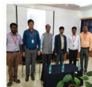
"Effective Business plan preparation for beginners"