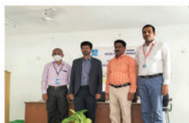
"Digi Payments- Way forward to Digital India"