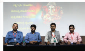
JITD Innovation Day by NISP