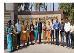
Industrial Visit To MSIPL