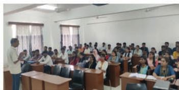
Career Connect Program