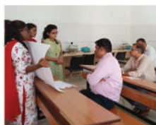
"Poster Presentation of Start-ups"