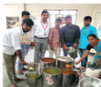
CSR at Veereshwara Punyshrama for Blind Students