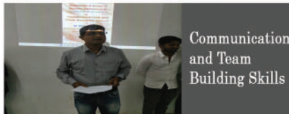
Communication and Team Building Skills

Organised workshop on "Innovative styles to employability in start ups- Unlock true potential" on 25th November 2021