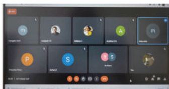
"Developing online repository of Ideas developed, and way forward plan"